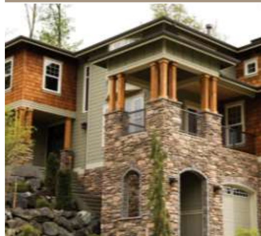
This can be a very good country home